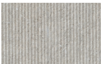
Charue 1 C1