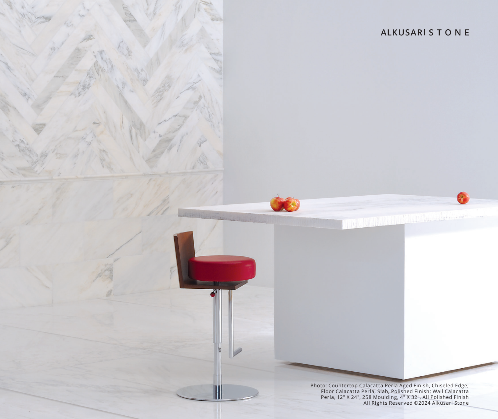
Photo: Countertop Calacatta Perla Aged Finish, Chiseled Edge; Floor Calacatta Perla, Slab, Polished Finish; Wall Calacatta Perla, 12" X 24", 258 Moulding, 4" X 32", All Polished Finish