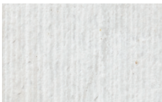
Charue 1 c1