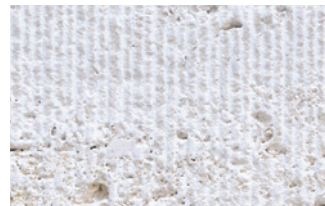
Charue 1, Filled c1-F