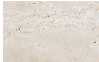
Honed, Not Filled HN-NF