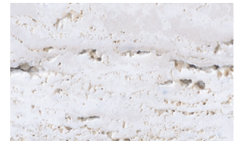
Matte, Not Filled MT-NF