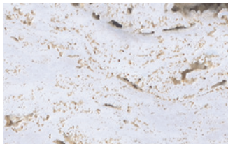
Raw, Not Filled RW-NF