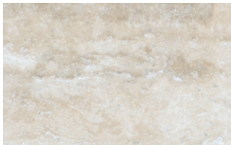
Honed, Filled HN-F