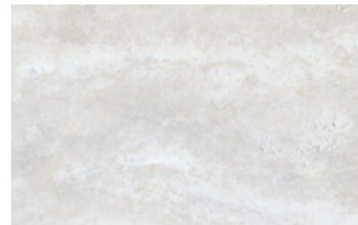
Matte, Filled MT-F