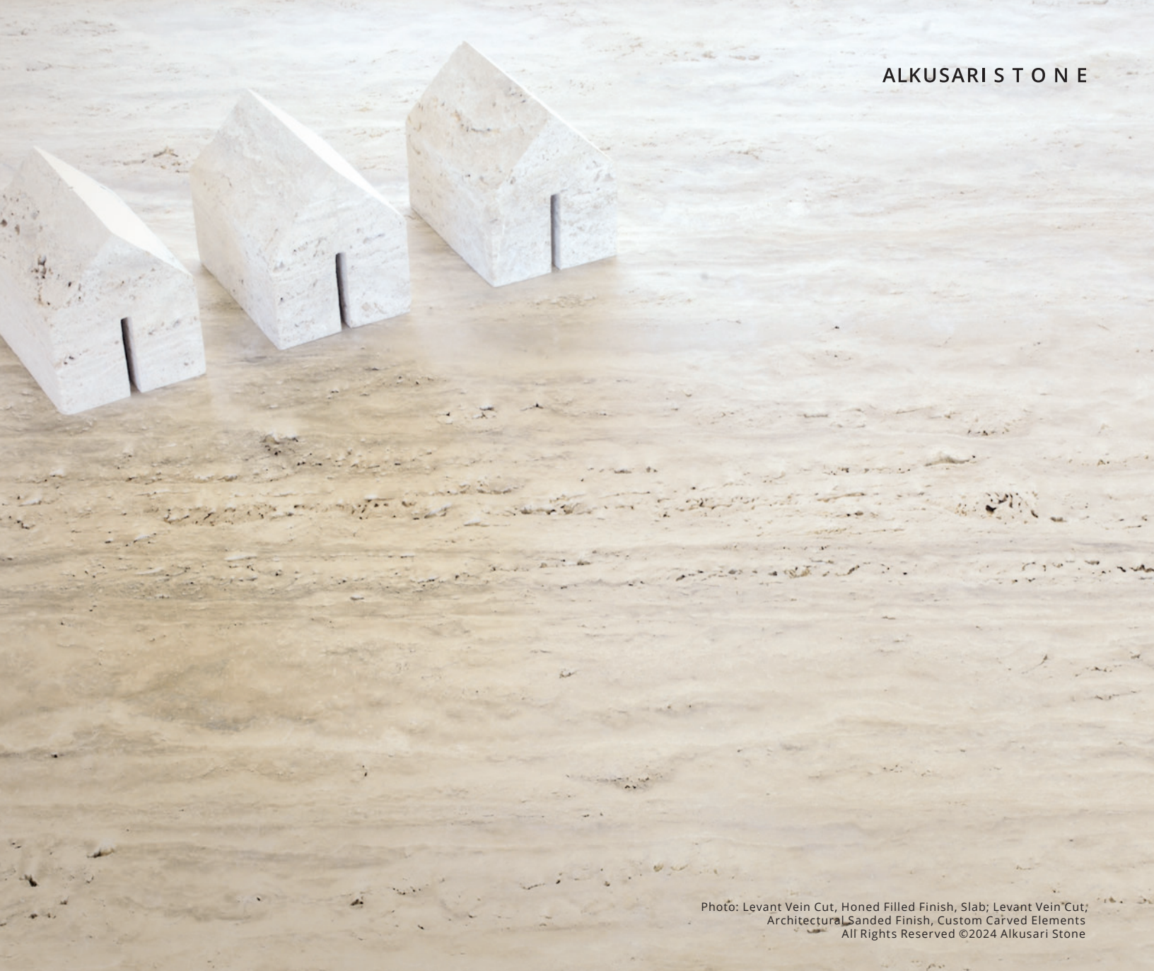
Photo: Levant Vein Cut, Honed Filled Finish, Slab; Levant Vein Cut, Architectural Sanded Finish, Custom Carved Elements