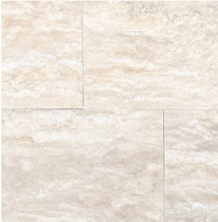
Honed Finish, Filled

Please contact us if you require additional custom sizes and thicknesses for your project. As the source and manufacturer, we are capable of providing bespoke material to our customers.