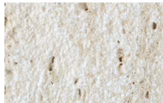
Buchard, Not Filled BC-NF