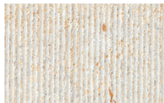
Charue 1 CI